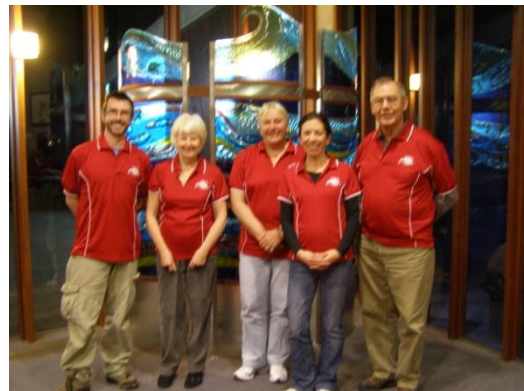
Friends proudly wearing the new Polo shirts