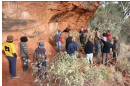
Face to face interpretations draws an appreciative crowd.

The Martu are renowned as being amongst the last 'traditional' people on earth to encounter European settlers and were still 'walking' the desert up until the late nineteen seventies. The