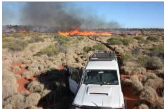
Traditional mosaic burning of Spinifex on the Puntawarri track.

When we mention a connectedness with community, then I could not conceive of anyone being more fully connected with their environment, physically, mentally and spiritually than the Martu and the Ranger team. At every opportunity families and communities venture into the 'bush' and there is a collective euphoria upon returning to country, in our case